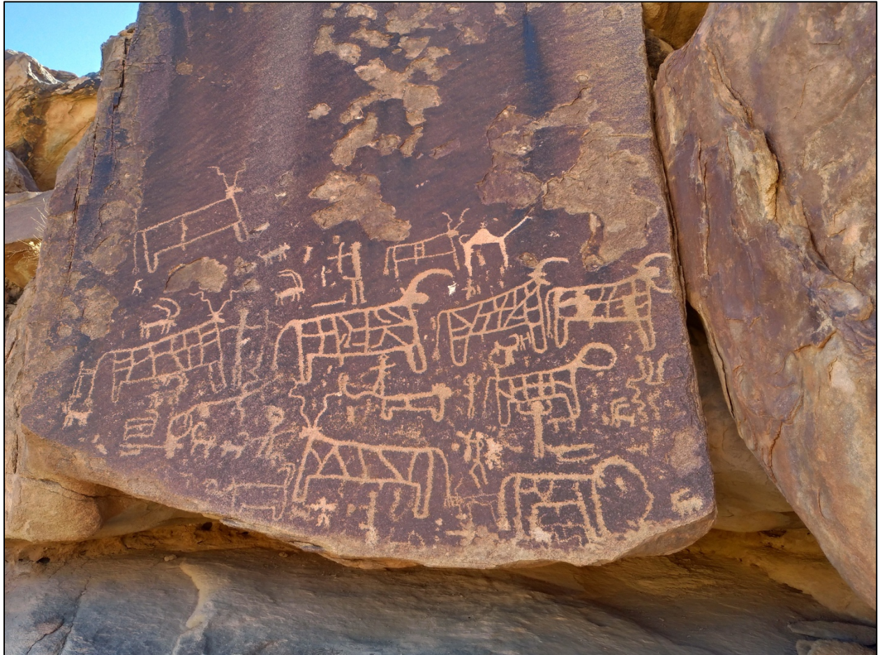
Cow worship at the base of Mount Sinai, Saudi Arabia

In Midian, God judged the Hebrews for the worship of a golden calf. They could literally see God’s glory on the mountaintop yet they worshiped a man-made young bull. The Apostle Paul says in 1 Corinthians 10:8 that 23,000 Hebrews died that day because of false worship.