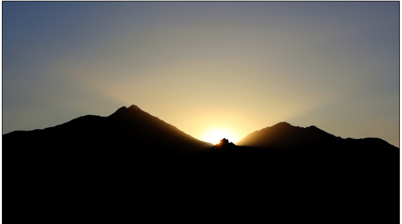
Sunset over the Mount Sinai in Saudi Arabia

When God met Moses in the burning bush he said, “When you have brought the people out of Egypt, you shall serve God on this mountain” (Exodus 3:12). And so, after the Lord delivered the people of Israel from the Egyptians, they traveled to the “mountain of God” in Midian where God had first revealed Himself to Moses (Exodus 18:5, 24:13).