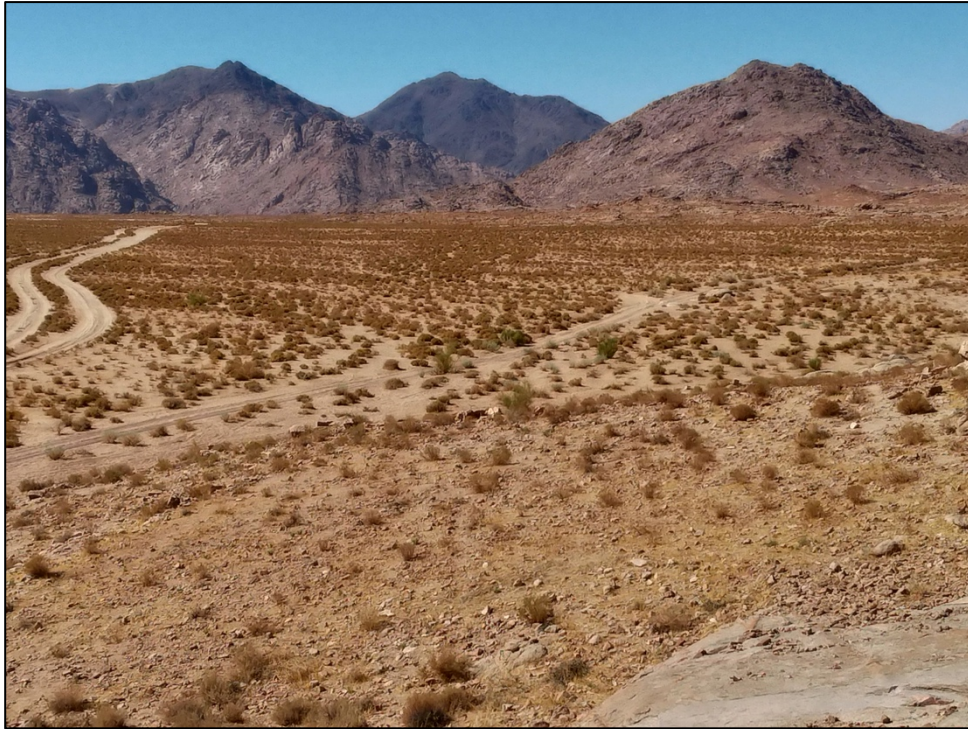
Possible Sinai campground in Midian, sight of the first tabernacle